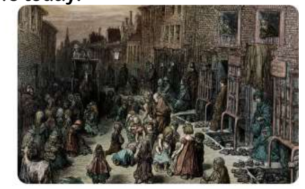
Poor Victorian families